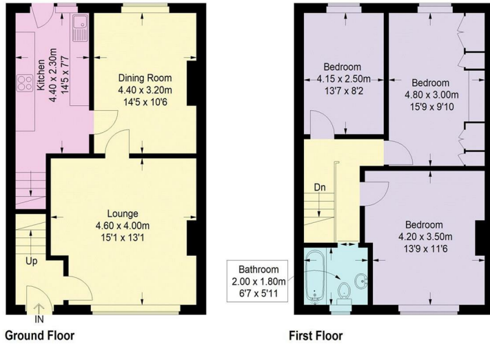
Illustration for identification purposes only, measurements are approximate, not to scale. FloorplansUsketch.com © 2022 (ID 862046)

Approximate Gross Internal Area = 103.7 sq m / 1116 sq ft